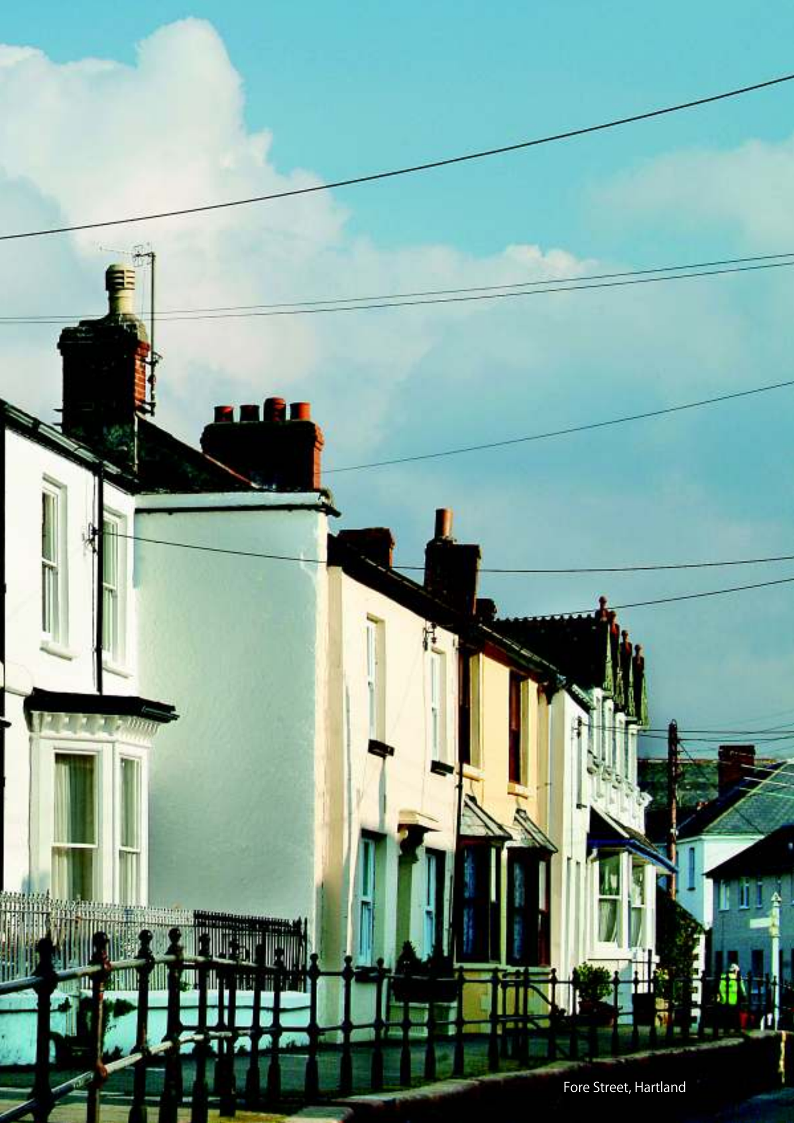
Fore Street, Hartland