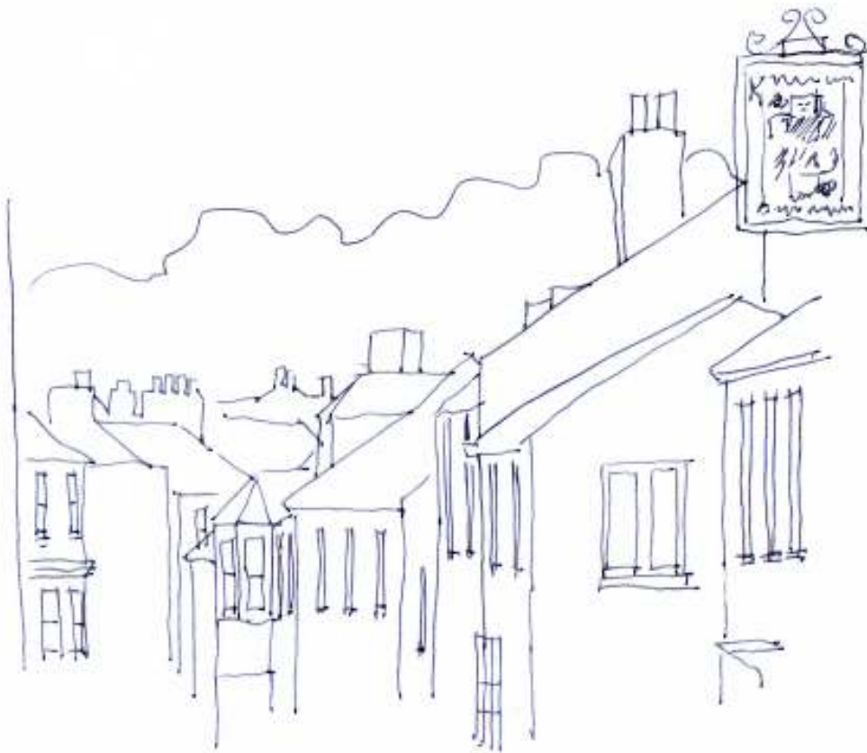
Scale and Massing, Hartland village

New development should take full account of the relationship with existing surrounding building, important views and open spaces. The shape of the land, layout of other buildings, positions of trees and hedges should all be used to tie the development to the site. The principles of sustainability (as outlined in section x) should be incorporated, such as orientating the building to make the most of passive solar gain. Variety in building heights can create an attractive and interesting roofscape and should be encouraged. The settlements in Hartland Peninsula comprise of differing sized building footprints, resulting from evolution and the extension of individual buildings. Proposals should respect the patterns of existing development through appropriately sized building footprints.