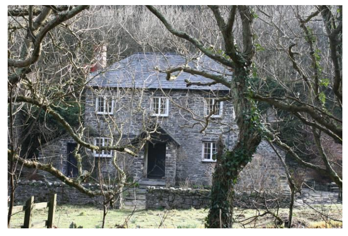
Survey points: SS285259, SS289259, SS296259, SS298261, SS298263